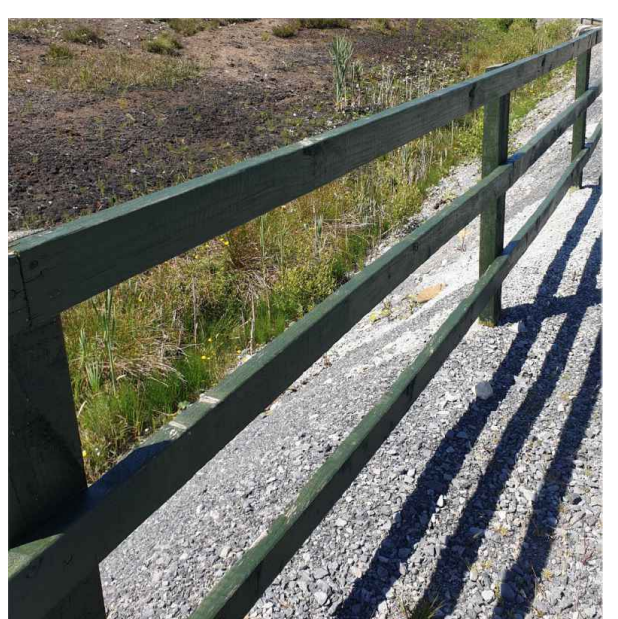
Timber Post & Rail Fence Detail